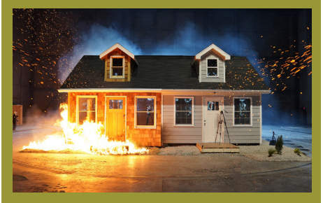
Figure 2b Embers impacting a building: left side with combustible (wood) and the right with noncombustible (rock) mulch.